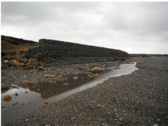
Gabions erected to protect the Crossscanonby Salt Pans

Crossscanonby was visited during the Ecosal Atlantis project in 2012 when its vulnerability to coastal erosion was compared to the Roman salt making site at Trebarveth, Cornwall, the seventeenth century site at Port Eynon, Gower, Wales, and two sites in Scotland at Brora, Sutherland and St Monans Salt Works, Fife. Only Crossscanonby and Port Eynon have coastal protection measures in place. The site at Brora has been excavated in advance of almost complete destruction. See more about the discoveries at Crossscanonby and the research grant awarded by the AIA on pages 10 and 11.