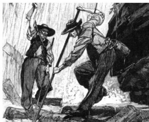
Timber floating from the Trient Gorges to the river Rhône, 1889...