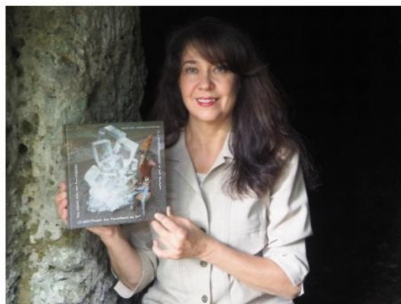
The author with her book inside the underground brine reservoir of Sanfins, dug in the 18th century under the site of Salin in the Chablais vaudois and listed as a historic monument.