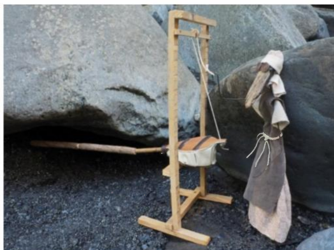
The female bellows operator : her work consists of activating a bellows linked to a wooden pipe, in order to send air to the miner who is suffocating in the scarce and dusty atmosphere of the galleries...