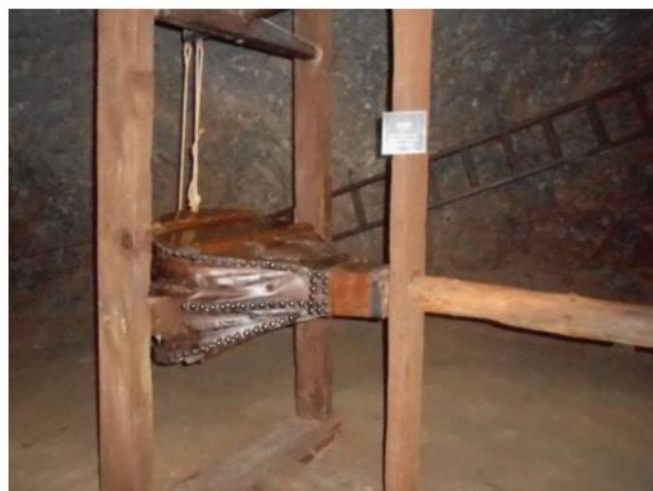
and an old bellows inside the Bex salt mine.