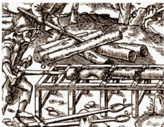
Georg Bauer, De re metallica , 1556, Twelfth book : the augerer....